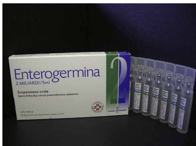
Fig. 2. Enterogermina ® . This is a licensed OTC product containing 2 \times 10^9 of GMP-produced spores of B. clausii in 5 ml of water. 2–3 vials are consumed per day to help prevent gastroenteritis in infants and children.

Natto strain it is produced at high levels. Second, it cannot be ruled out that health benefits ascribed to Natto require consumption of both soybeans and bacteria, rather than just the bacterium. In any event, Nattokinase has GRAS status as an enzyme produced from a bacterium in the US and is purified and sold as a health supplement worldwide. In poultry studies controlled trials have shown that oral administration of B. subtilis spores reduce infection by Salmonella enterica serotype Enteritidis, Clostridium perfringens and Escherichia coli O78:K80 (La Ragione et al., 2001; La Ragione and Woodward, 2003).