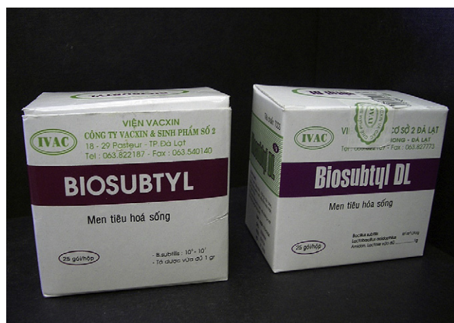
Fig. 3. Biosubtyl and Biosubtyl DL. Typical Vietnamese products, in this case, Biosubtyl that carries spores of B. cereus IP5832 and Biosubtyl DL carrying a mixture of B. cereus IP5832 and Lactobacillus acidophilus . Neither product is labelled properly nor carries the stated dose.

Bacillus species are often considered soil organisms since spores they can readily be retrieved from soil. However, attempting to isolate vegetative bacteria from soil is more problematic and it now