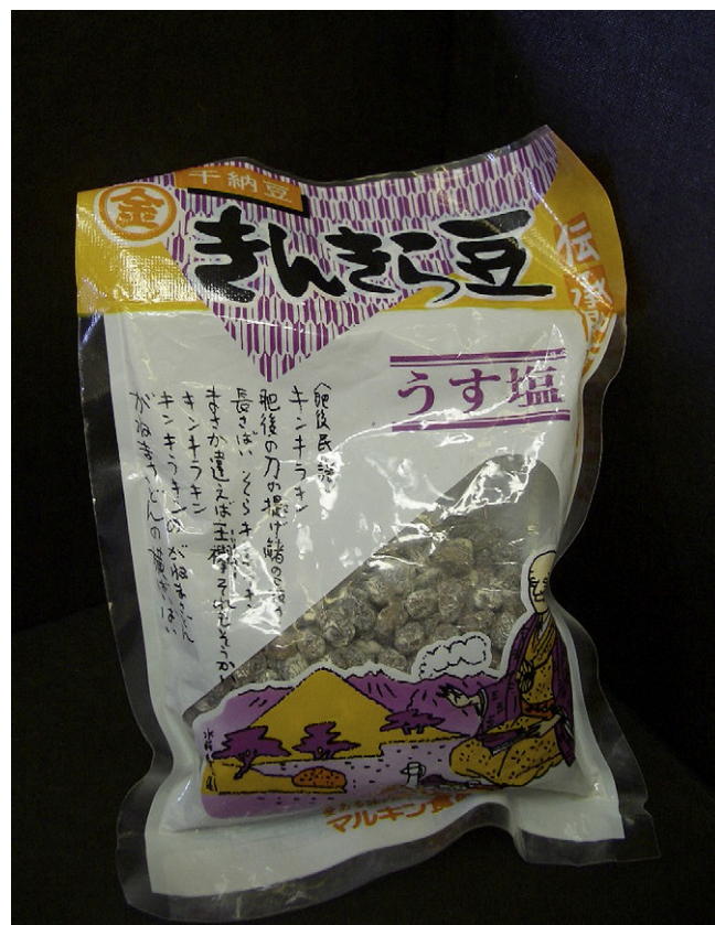
Fig. 4. Natto. Natto is normally consumed as a fermented soybean product either hot or cold. In this example it is sold as a snack with dried soybeans coated with a fine white powder of B. subtilis var. Natto, the active ingredient required for the taste and texture of Natto.

B. subtilis and B. licheniformis are used together in two products, Biosporin and BioPlus ® 2B. BioPlus ® 2B is used in animal feed while Biosporin is licensed as a medicine in the Ukraine and Russia. Biosporin is sold in glass vials that must be reconstituted in water before consumption. The two Bacillus strains, B. subtilis 2335 and B. licheniformis 2336 are well characterised and a number of clinical studies have been used to demonstrate probiotic effects although none been performed with the rigour of a full clinical trial (Bilev, 2002; Osipova et al., 2003, 2005; Sorokulova, 1997; Sorokulova et al., 1997). Interestingly, B. subtilis 2335 has been shown to produce the antibiotic Amicoumacin with in vitro activity against